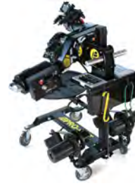
Brake Lathe Package