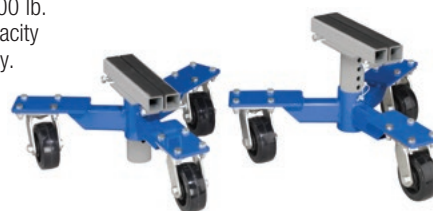
$415.00 Regular Price $477.00

16-1572 Pair of Car Dollies, 3,600 lb. capacity (1,800 lb. capacity each). Lifetime Warranty. Sold in pairs.