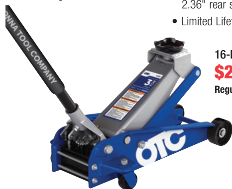
16-LDJ3-A $270.00 Regular Price $311.00