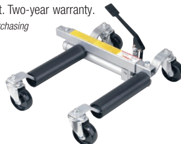
16-1580 $235.00 Regular Price $273.00

(Sold individually, recommend purchasing a minimum of two Easy Rollers.)