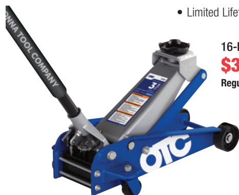
16-LDJ3-A $380.00 Regular Price $440.00