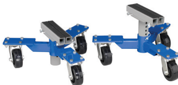
16-1572 $585.00 Regular Price $674.00