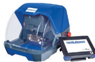
High Security Key Cutting