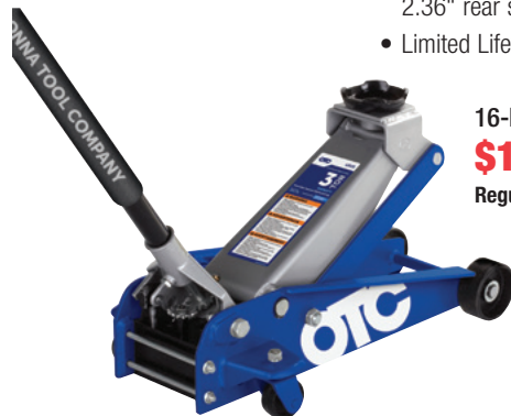
16-LDJ3-A $180.00 Regular Price $206.00