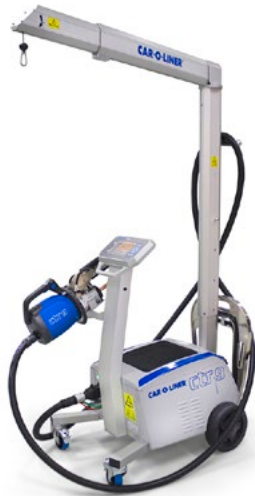
200-CARNA90576 CTR9 208V Spot Welder