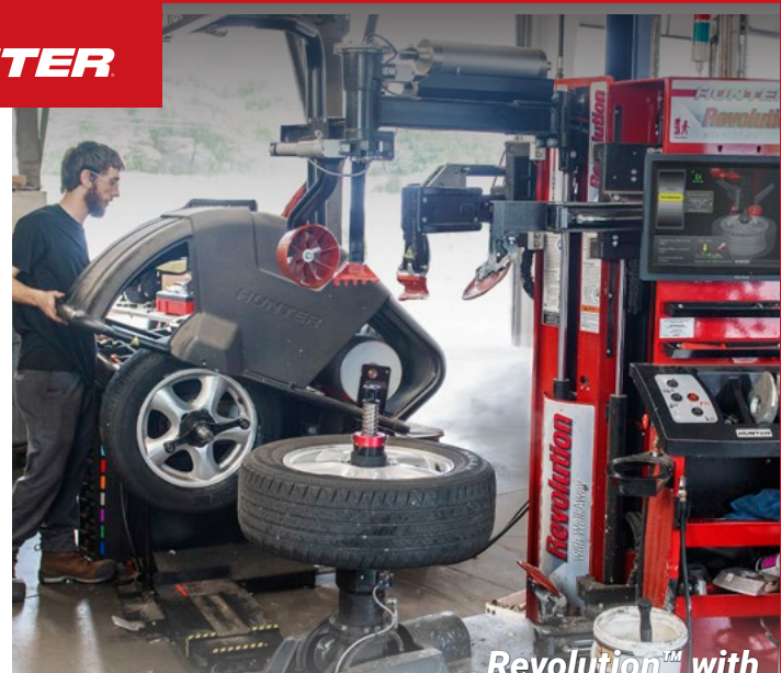
Road Force® Elite Revolution™ with Walkaway™