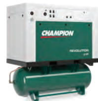
Compressed Air System