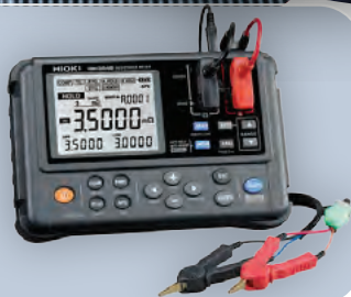
785-RM3548 Resistance Meter