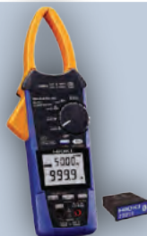
785-CM4375-90 AC/DC Clamp Meter with Wireless Adapter