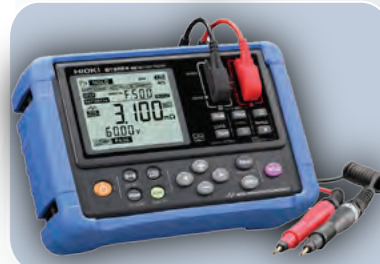
785-BT355451ProKit Battery Tester