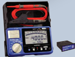
785-IR4057-90 Insulation Tester