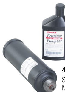
42-13172 Spin-On Filter Maintenance Kit with 42-34724 Filter