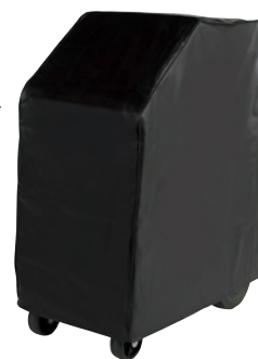
42-17499 Dust Cover